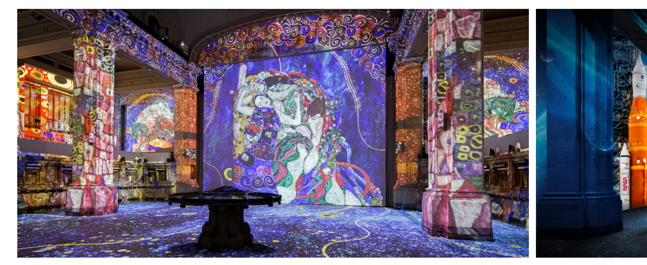
Immersive Art Exhibition 'Gustav Klimt: Gold in Motion' September 9th through July 16th 2023