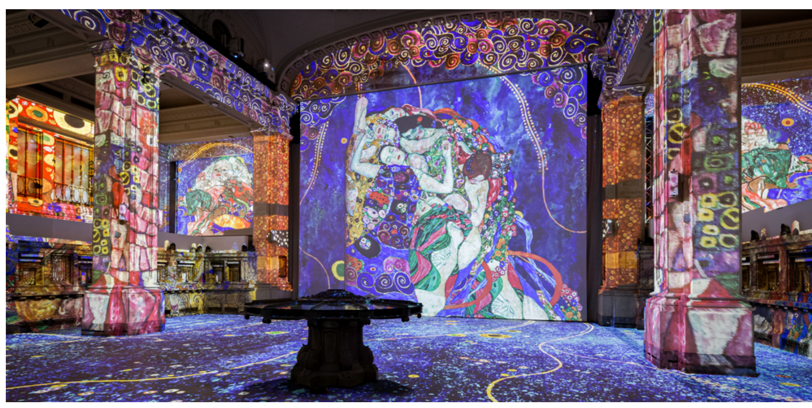
Immersive Art Exhibition 'Gustav Klimt: Gold in Motion' September 9th through July 16th 2023