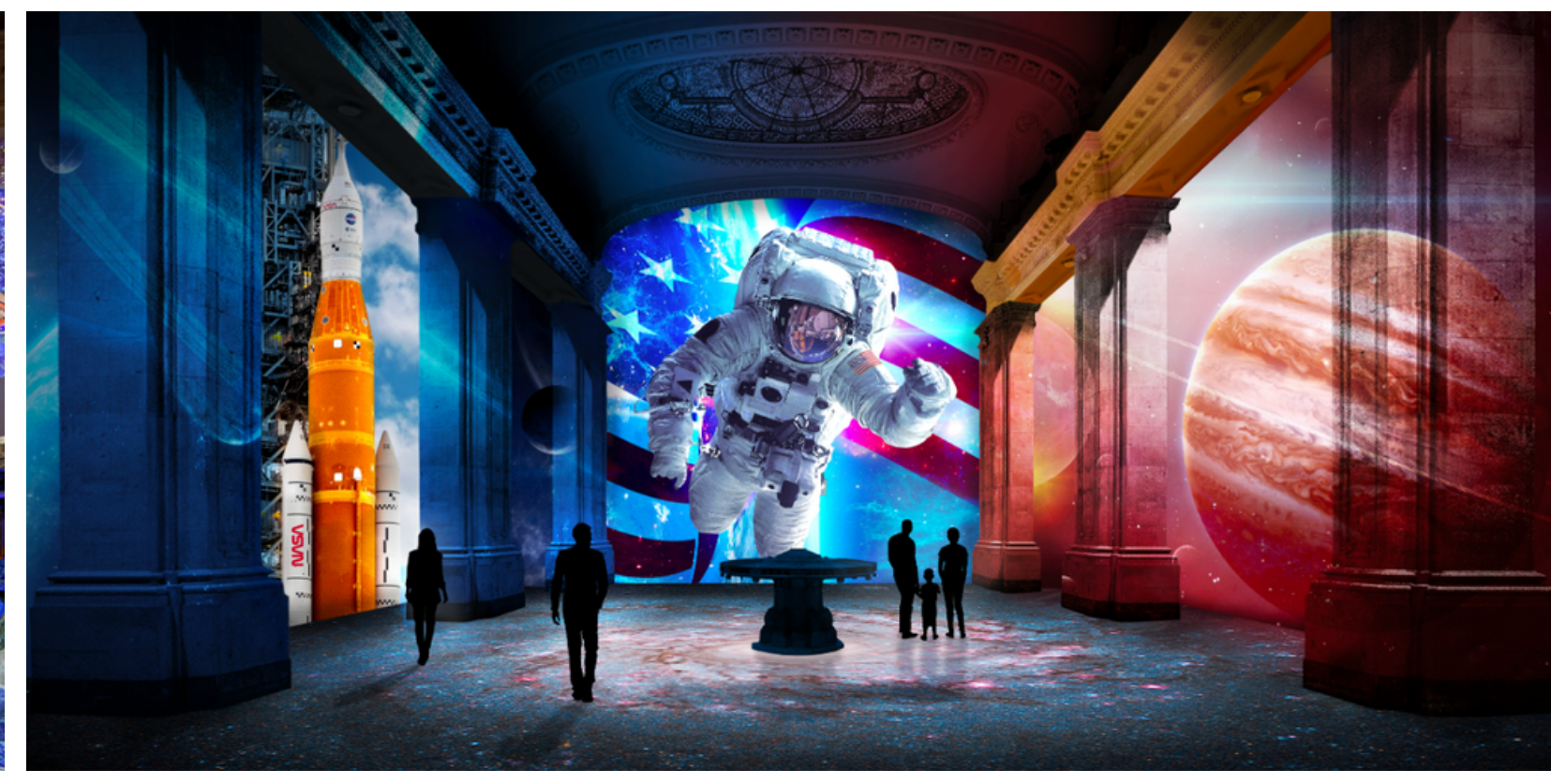
Immersive Space Exhibition 'Destination COSMOS', with participation from NASA From April 7th through July 16th 2023