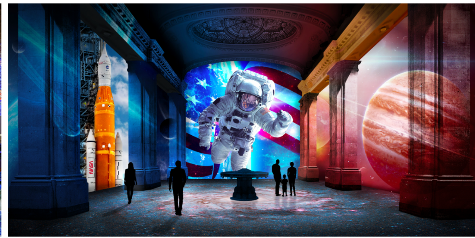
Immersive Space Exhibition 'Destination COSMOS', with participation from NASA Opening From April 7th through July 16th 2023