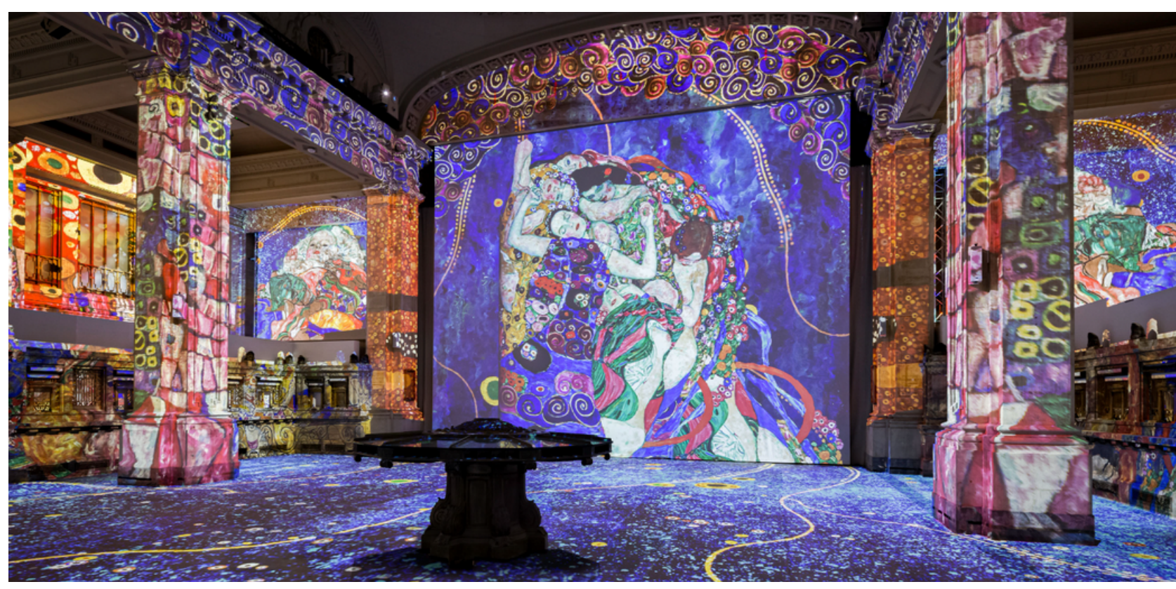
Immersive Art Exhibition 'Gustav Klimt: Gold in Motion' Showing through July 16th 2023