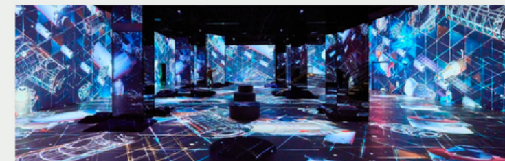
PART 2: THE SOLAR SYSTEM

In the heart of Florida, you'll travel over the NASA Kennedy Space Center at Cape Canaveral. Then, see the construction and launch of the first space rocket in the Artemis program in 2022. NASA's new rocket engulfs you in a cloud of smoke and the intense roar of its engines as it rises upward. The curvature of the Earth emerges, followed by a magical view of our planet from space. From the island of Manhattan, to the Himalayan summits and a multitude of landscapes that change with the seasons, we fly over and reflect upon the beauty of our home.