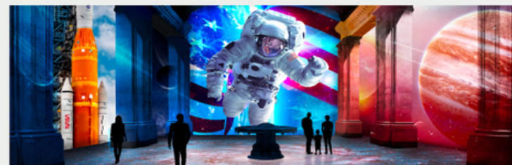
DESTINATION COSMOS: THE IMMERSIVE SPACE EXPERIENCE WITH PARTICIPATION FROM NASA

PROLOGUE The Ancient Human Dream of Space Exploration