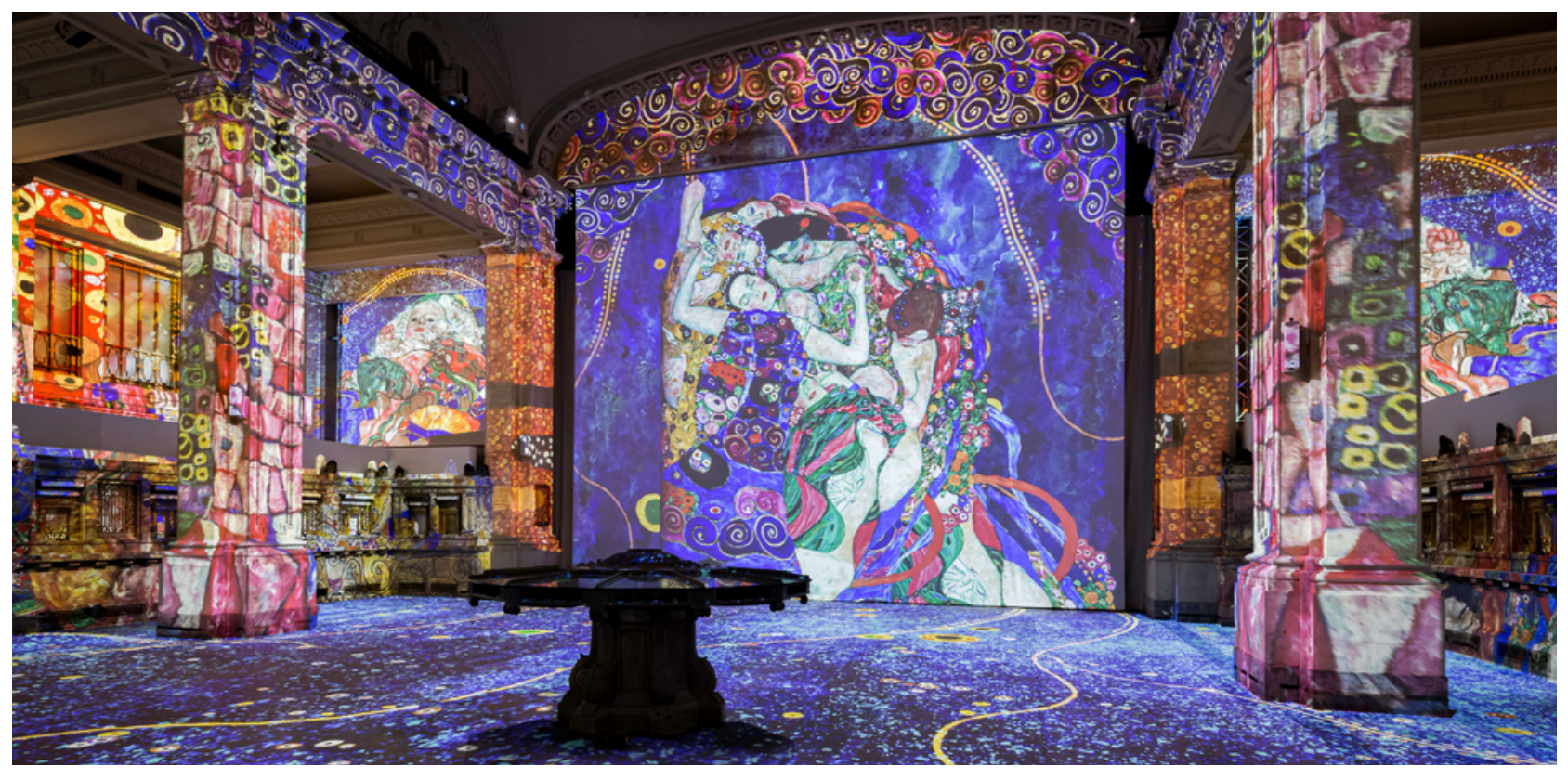
Immersive Art Exhibition 'Gustav Klimt: Gold in Motion' Showing through Summer 2023