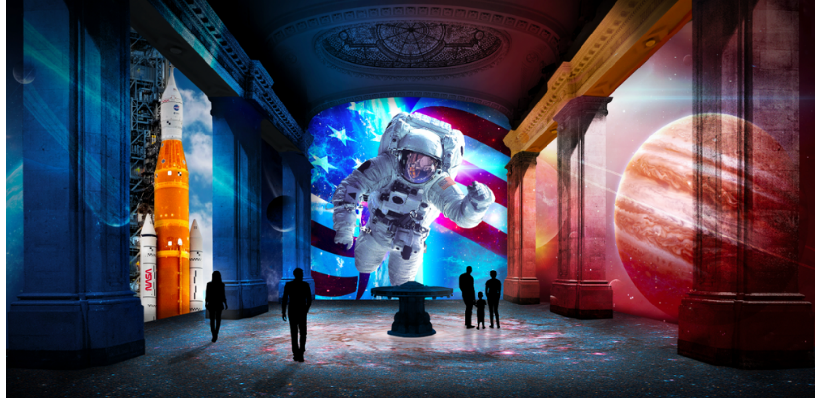
Immersive Space Exhibition 'Destination COSMOS', with participation from NASA Opening From 7th April through 4th June 2023